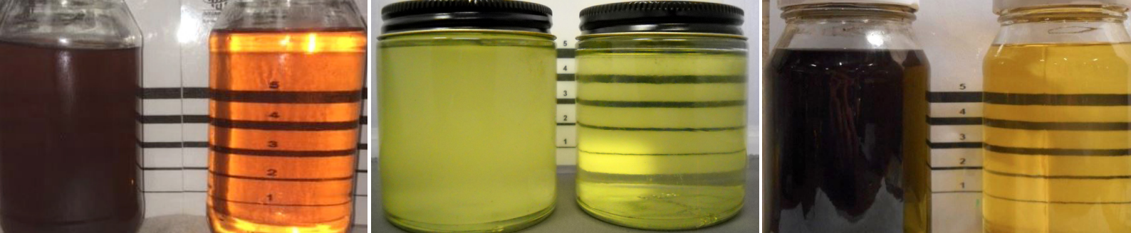
Before and after fuel cleaning samples